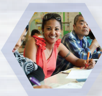
ENGLISH AS A SECOND LANGUAGE

On behalf of the faculty and staff at Watsonville/Aptos/Santa Cruz Adult Education, we invite you to take advantage of the dynamic learning environment and broad range of courses offered at the school. Select your classes and join us today!